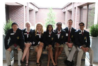
State Fall Leadership Conference - Page 2