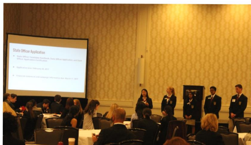
Our State Officers presenting "FBLA...to the Max," a workshop focused on the opportunities at the Regional and State Conferences.

The day was organized into four workshop sessions, two in the morning and two in the afternoon. Students had the opportunity to attend workshops, led by business professionals and the Maryland State Officer team, on a variety of topics from technology and entrepreneurship in the morning to accounting and networking in the afternoon. These workshop sessions were separated by the general