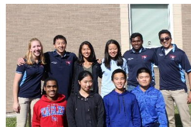
Chapter Visits - Page 3