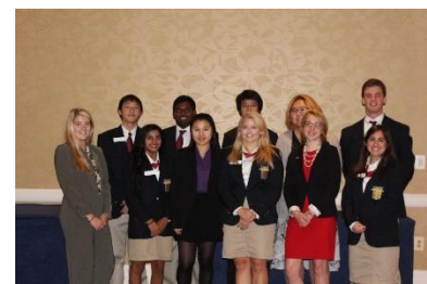
March of Dimes Signature Chefs Dinner - Page 3