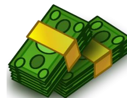
Fundraising Tips - Page 2