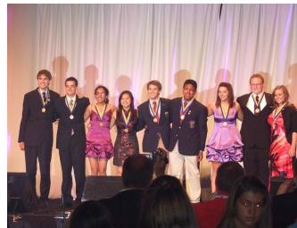
Shown Above: Your National Officer Team in Nashville Tennessee

Most states are lucky to have one or two members be